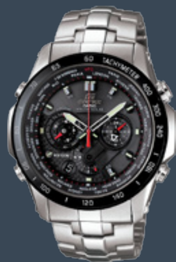
The EDIFICE EQS-A1000DB. The Solar-powered watch features a 1/20-second chronograph, Tachymeter, World time, 5 independent motors, Sapphire glass, 100-meter water resistance.